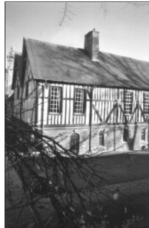
The Merchant Venturer's Hall, York.