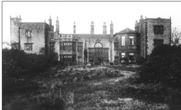
Bolling or Bowling Hall, Bradford, where the lady begged pity for Bradford.