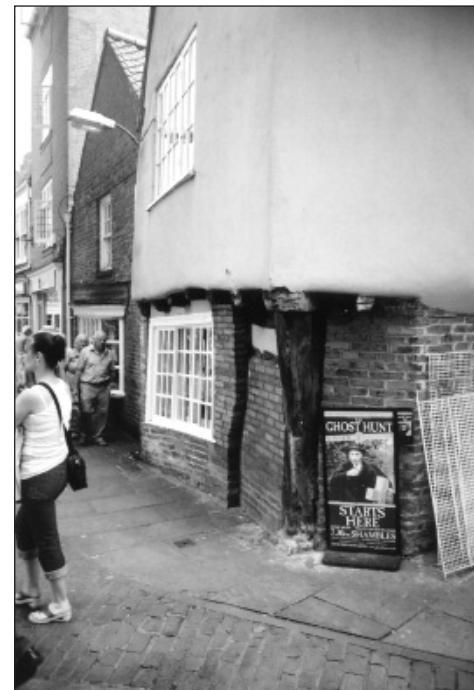
The ghosts of York are now the subject of a 'ghost walk'.