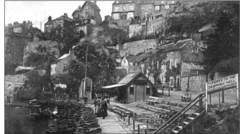
Knaresborough, showing the 'dropping well': Mother Shipton is not the only paranormal story here.